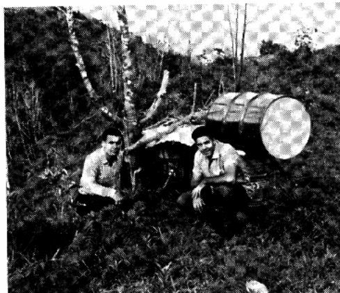
YV5AFH—Joe YV5AJK and Johnny YV5AKU, engineers in charge of the power plant which conked out at 2 o'clock in the mornng.

Multi-Operator Multi-Transmitter top six.