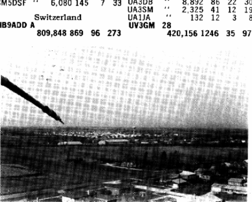
We see many photos looking up at beams and towers but here's one looking from the top down. It was taken from the "crow's nest" at the 120 ft. level of W9EXE's tower.

VK2APK 14 447,262 1030 36 11 VK2BNK " 12,544 72 23 4