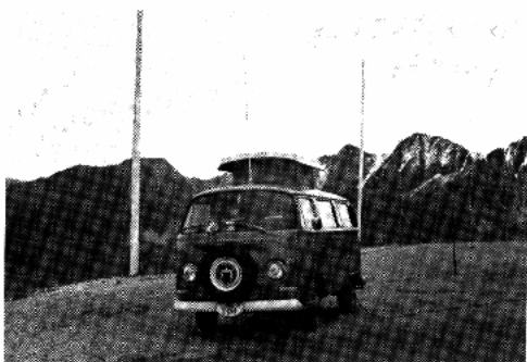
The fixed mobile location of C31CQ and the camper used by K2IXP high in the mountains of Andorra. Larry experienced freezing temperatures at this 8500 ft. altitude.

The call 9Y4AA may be new but not its operator. Jim Neiger, ex-ZD8Z again had the extra QSO point advantage for all those W/K contacts and nosed out Herb, KV4FZ for top honors.