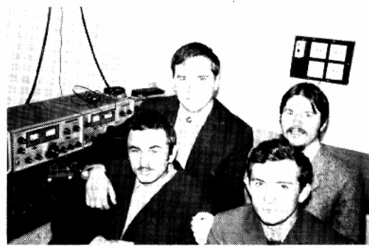
The operating crew of YU1BCD, winner of the multi-single division for Yugoslavia. L. to R. front: YU1QBC and Vlada; rear: YU1PCF and YU3EY.

SM3EP " 162,565 368 65 140 SM3AF " 141,050 448 43 112 SM3CX " 81,320 181 66 130 SM0BDS " 73,034 271 61 100 SM2CAA " 38,586 206 37 72 SM9FT " 32,732 233 29 69 SM7TQ " 28,783 118 41 66